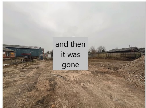
The same view in March 2024

We expect some disruption over the coming months, but will endeavour to continue opening the museum on the 2nd and 4th Tuesday each month as usual.