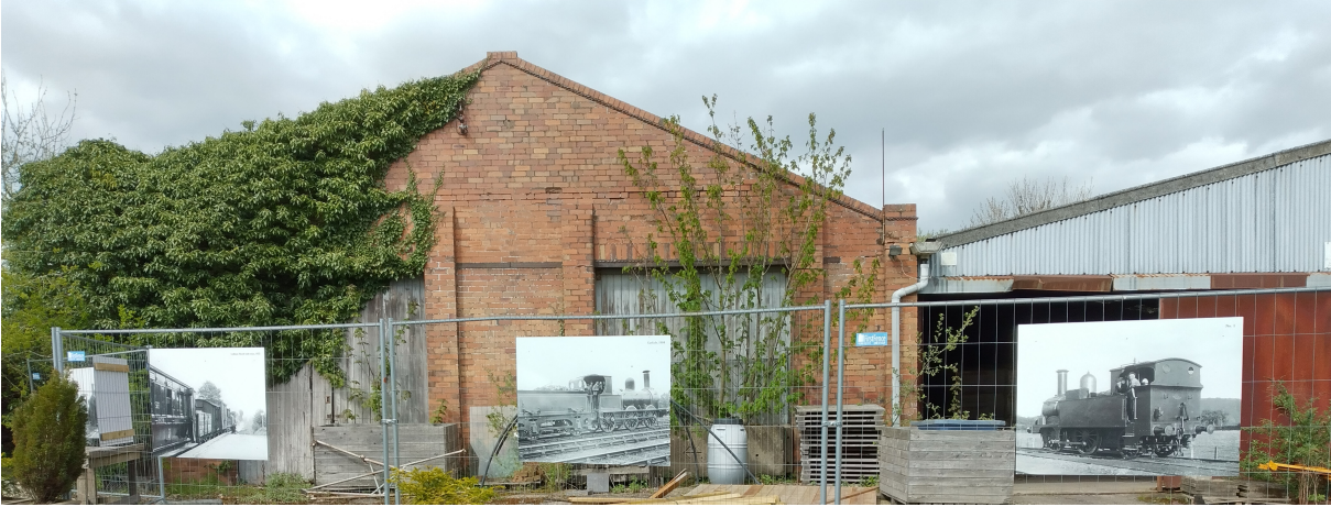
The view of the sheds from the Weighbridge in April 2023

After 2 years of Ransfords waiting for planning permission to be granted, it took just a few days to demolish the sheds and clear the site opposite the Weighbridge.