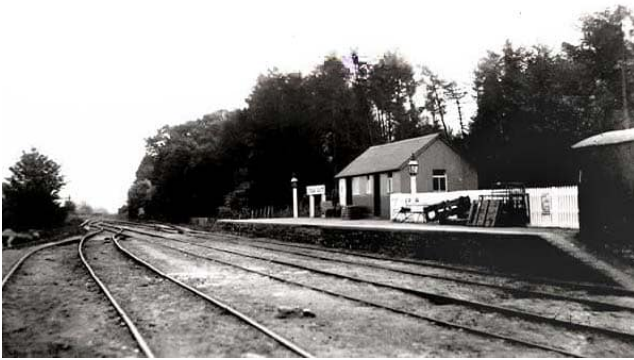
Lydham Heath station looking back towards the junction for Craven Arms and Bishop`s Castle.