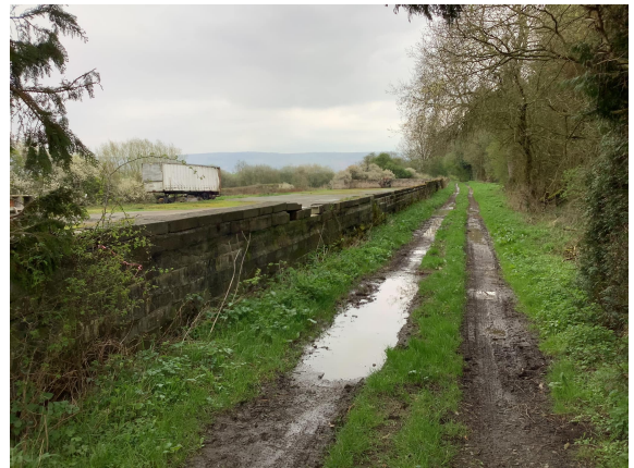
Site of Lydham Heath station looking towards the junction.