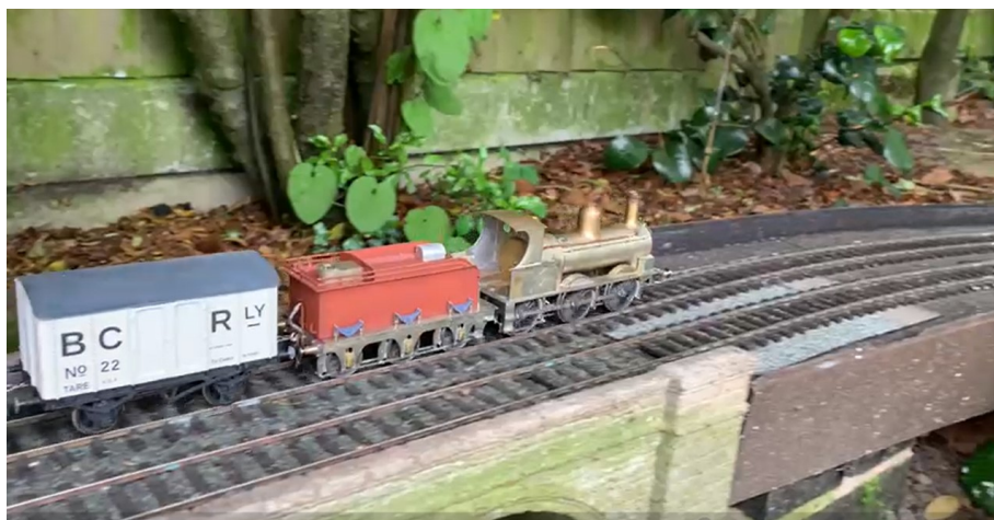
Peter`s 0 gauge Carlisle on it`s test run on a garden railway

We have waited almost 90 years for Carlisle to run again, and like buses, two have come along at once.