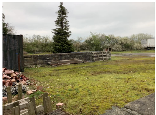
Lydham Heath station yard as it is today.