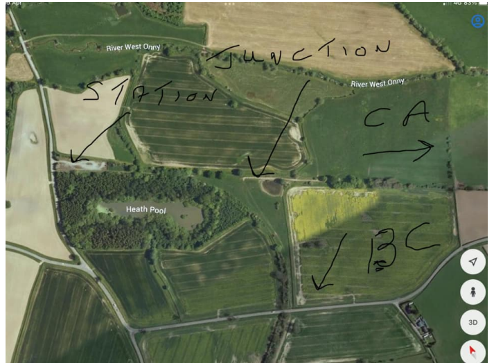
Google earth photo of Lydham Heath station and the junction.