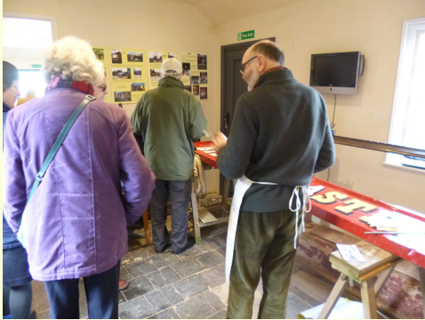
ARTS FESTIVAL WEEKEND