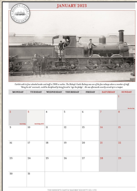
Cartchick with its four wheeled tender and staff in 1908 or earlier. The Bishop's Castle Railway was one of the few railways where a member of staff "killing his old" movement, could be disciplined by being forced to "sign the pledge". He was afterwards covertly served up in a soup.

THE BISHOP'S CASTLE RAILWAY SOCIETY CO. LTD