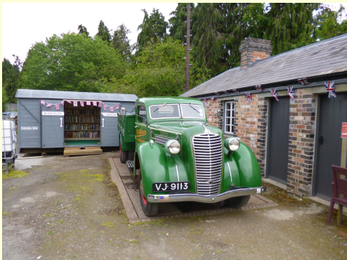
THE QUEEN'S PLATINUM JUBILEE