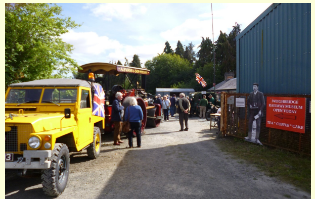
ABOVE and BELOW 'NOT THE MICHAELMAS FAIR'