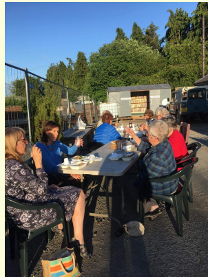
MAINSTONE WI LADIES