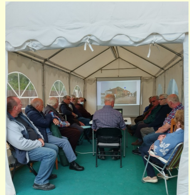
MIDLAND OIL ENGINE CLUB