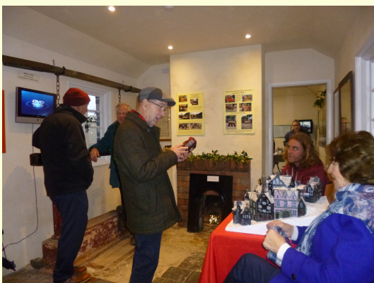
CHRISTMAS LIGHTS SWITCH ON