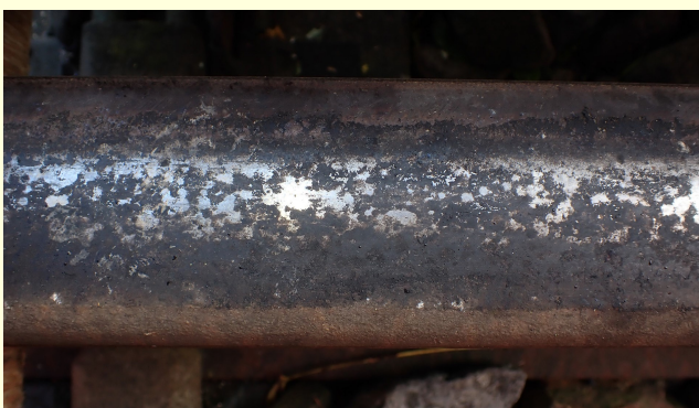
Photo below: Railhead contamination on the down main line near signal SY29R

Photo right: The down main line near SY31 signal, showing railhead contamination