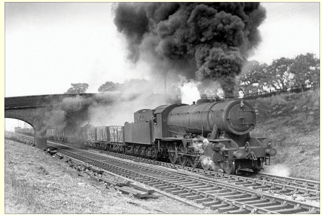
Picture above—The freight traffic work horse built during the second world