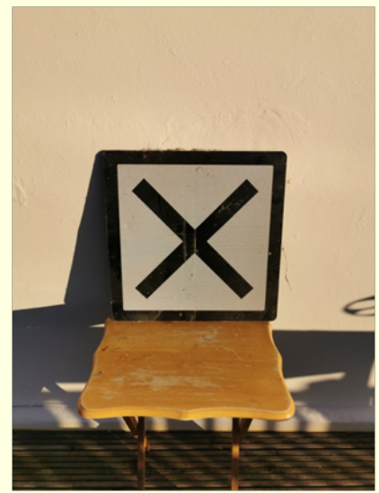
Forden Station Crossing Sign Newtown- Welshpool Size 1` 10" x 1` 10"