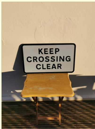
Forden Station ex Cam- brian, Newtown-Welshpool Size 2` x 1` 3"