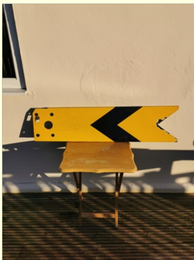
Distant Signal with Sema- phore ex. Central Wales Size 3` 6"x 10"