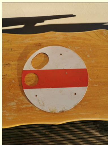
Ground Stop Signal ex. Central Wales Size 16"