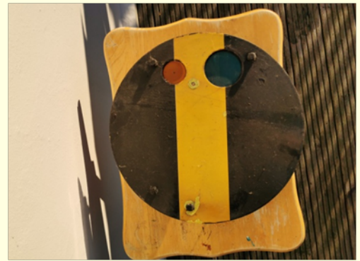
Ground Distant Signal ex. Central Wales Size 16"

L.N.E.R. ex. Craven Arms North signal box First Aid Stretcher plus other genuine railway memorabilia.