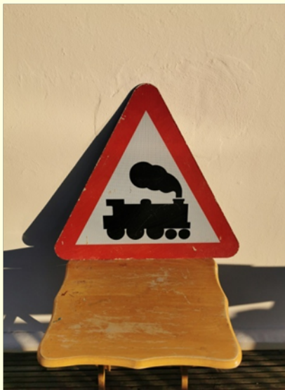
Forden Station Crossing Sign ex. Cambrian, Newtown- Welshpool Size 2` x 2`