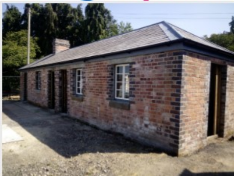
The Railway Weighbridge Building Station Street, Bishop's Castle, SY9 5AQ

Social distancing will be in place with a one way system through the building and a limited number of people in each room